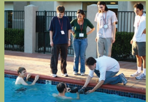
Hertz Fellows get creative in the "Toxic Waste" Engineering Challenge at the West Coast Retreat.