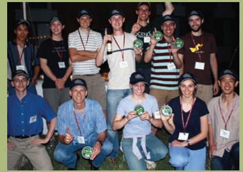
2011 Summer Workshop Engineering Challenge Winners

Scientists at Harvard have harnessed the prowess of fast-replicating bacterial viruses, also known as phages, to accelerate the evolution of biomolecules in the laboratory. The work could ultimately allow the tailoring of custom pharmaceuticals and research tools from lab-grown proteins, nucleic acids, and other such compounds.